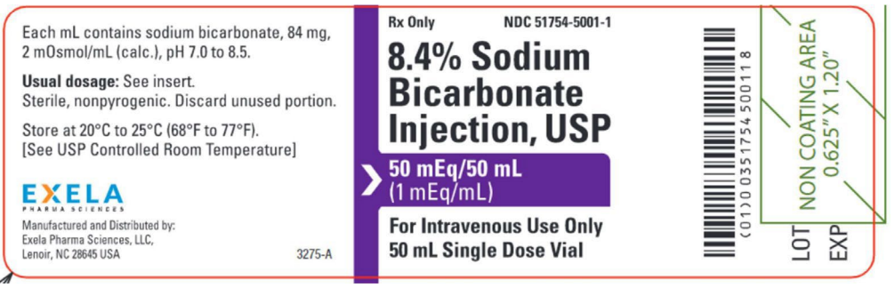
Figure 1 – Exela Vial Label

8.4% Sodium Bicarbonate Injection USP is used for treatment of metabolic acidosis and is packaged in a 50 mL glass single dose vials, 20 vials per carton Exela brand (Carton NDC: 51754-5001-5; Vial NDC: 51754-5001-1, Figure 1) and 25 vials per carton Exela brand (Carton NDC: 51754-5001-4; Vial NDC: 51754-5001-1) and Civica brand (Carton NDC: 72572-740-20; Vial NDC: 72572-740-01, Figure 2).